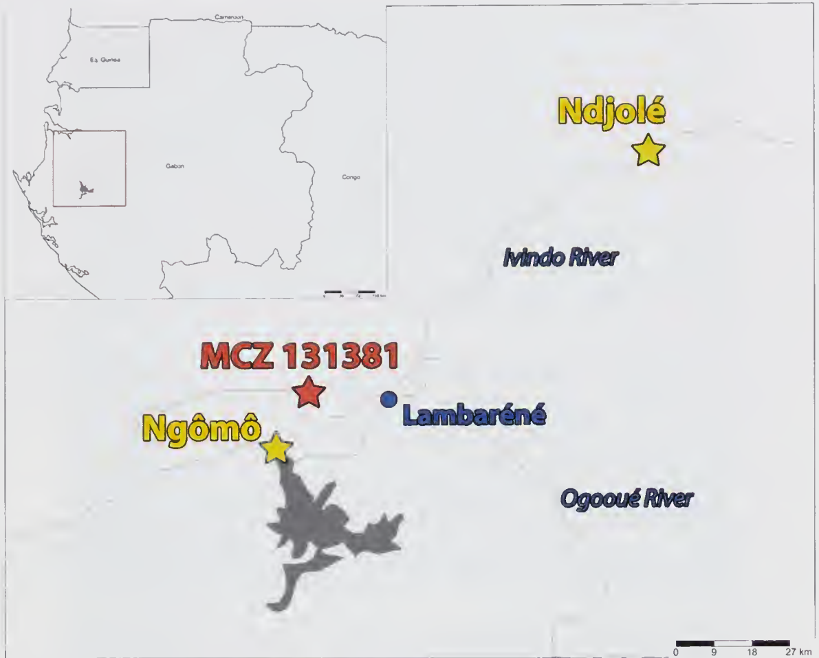
Figure 1. Map of the Middle Ogooué river section, with the traditional localities of Ngômô and Ndjolé (yellow stars), and the newer collection point west of Lambaréné (red star). Inset shows the larger region, and the red square identifies the studied region.

Although Talagonga was the “most advanced mission station” in the late 1800s and early 1900s, it is not found on modern maps but was located in the rapids of the Ogooué river, near Ndjolé (in modern spelling). These specimens are thus found quite a distance from the former ones from the Abanga-Bigne Department of the Moyen-Ogooué Province.